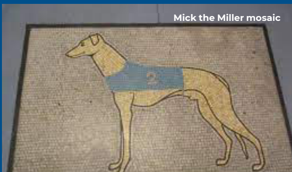
Mick the Miller mosaic